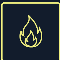
ENHANCED FIRE PROTECTION