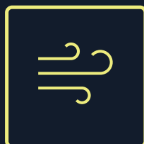
TOXIC GAS FILTER