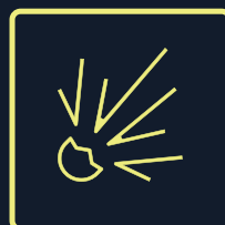
SUPPRESS THERMAL RUNAWAY